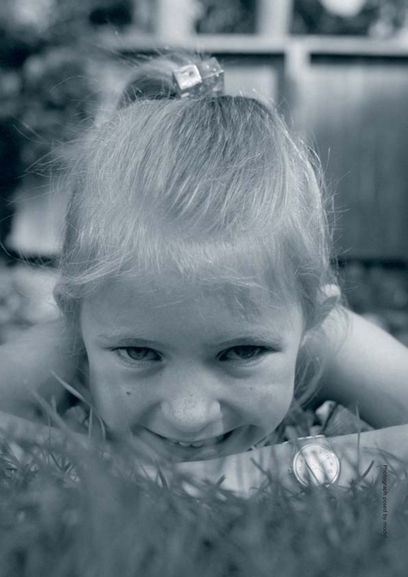
Photograph posed by model